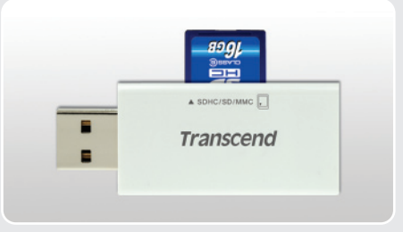
Card reader included (16GB SDHC package)